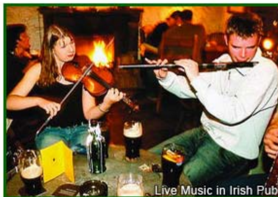
Live Music in Irish Pub