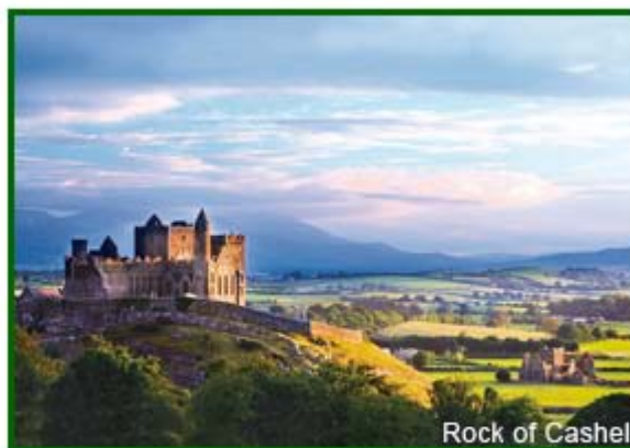
Rock of Cashel