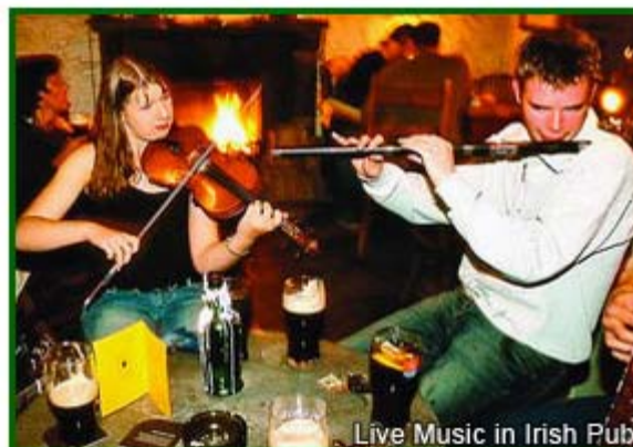
Live Music in Irish Pub